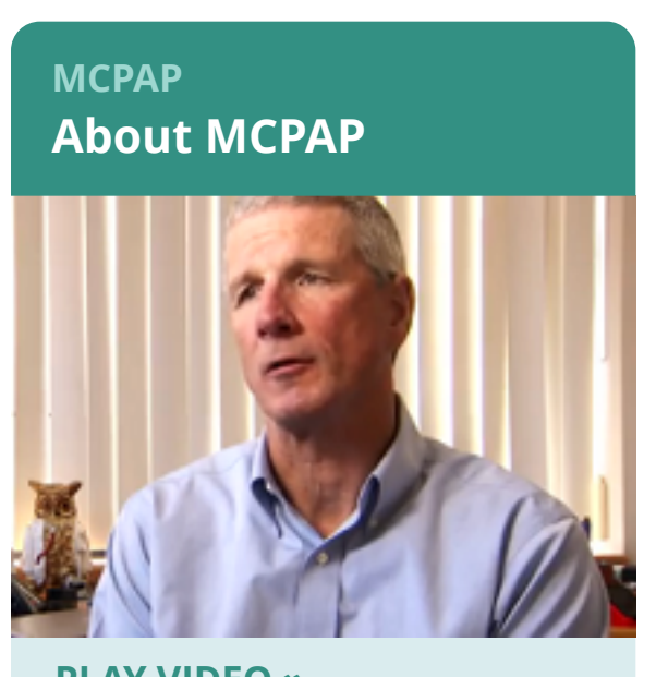
PLAY VIDEO »