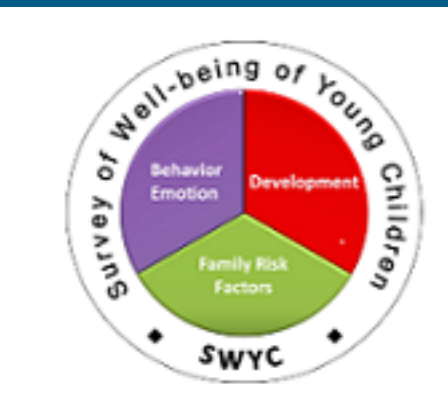
ACCESS TOOL HERE »